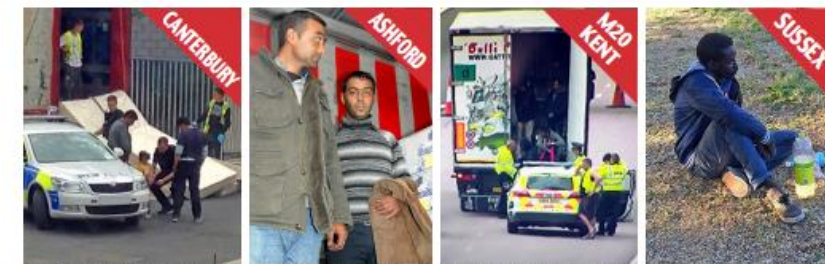
Making it through: Police across southern England arrested alleged illegal immigrants yesterday after hundreds stormed the Channel Tunnel entrance in Calais

As police seize stowaway migrants across South, Cameron is attacked for 'likening them to insects'