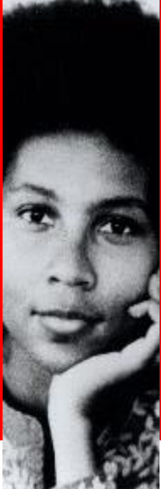
BELL HOOK 'FEMINISM'